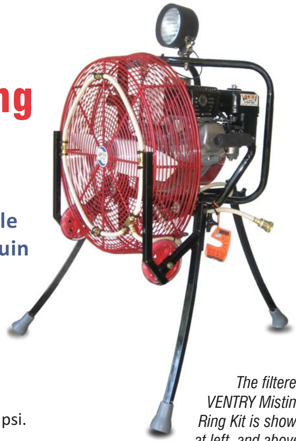
The filtered VENTRY Misting Ring Kit is shown at left, and above, installed on a 20-inch VENTRY Fan

Our low-pressure Misting Ring Kit can be added to any of our VENTRY Fan models and retrofits to any fan with a wire guard, regardless of manufacturer. If you already have a VENTRY Fan (or any fan with a wire guard), you can order the Misting Ring and easily install it yourself. All hardware is included.