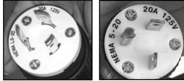
Figure C: 20 Amp Plug Choices Locking L5-20 Straight 5-20