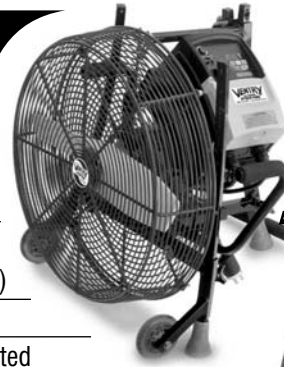
Figure A: Model 20E1.5 is not for use on GFCI circuits. This fan includes Solid Rubber Wheels and a Rear Folding Tow Handle, which folds against the fan body when not needed, as shown.